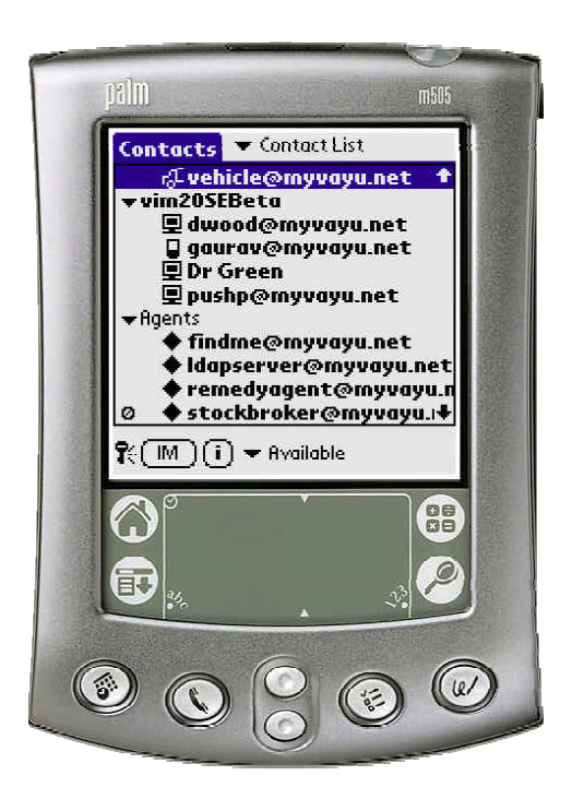
Figure 2: IRiS-Enabled Device Example

The Response Agents are a key component in enabling the investigation and resolution functionality of IRiS. A field service technician's instant messaging device can be populated by a set of Response Agents that act as proxies for different back office and front office applications that are needed for investigation and resolution. Rather than the static, message-only mode available from a purely instant messaging solution, the presence of these Response Agent proxies allows the user to query other applications for data, launch processes for resolving problems, and notify other employees and applications of a successful resolution.